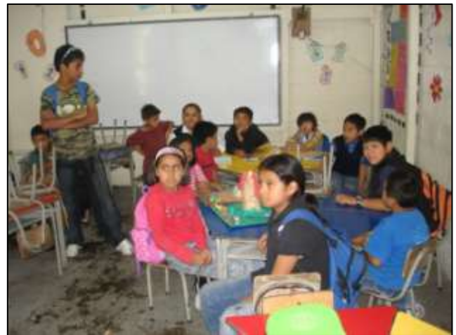
Students in the classroom at Potter's House

children alike, known as "scavengers" spend their days in the filth and rubbish collecting anything that has been discarded that could be of value. Potter's House has a portfolio of five programs that model the changes that would improve the lives of these scavengers. The programs focus on personal development, education, health, micro-enterprise, and community support. The ultimate goal for Potter's House is to provide a means by which participants can live in a healthy, respectable, prosperous environment. Otis McAllister has donated money to Potter's House which has gone to providing a classroom and school supplies, school and sporting uniforms, shoes, and nutritious meals for students. For more information about the Potter House program, please visit www.pottershous.org.gt